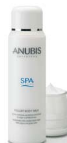
YOGURT BODY MILK